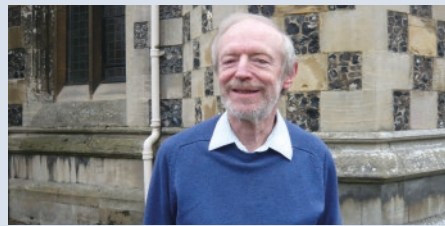
Buildings News from Ralph Gough - P3