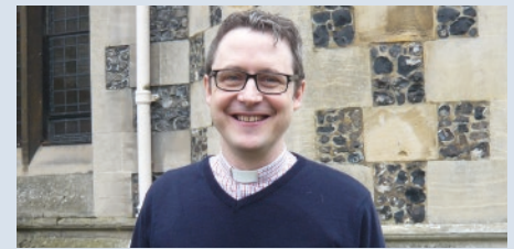
The civic nature of Luton Parish Church - P4