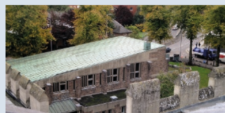
News from the Church building committee - P4