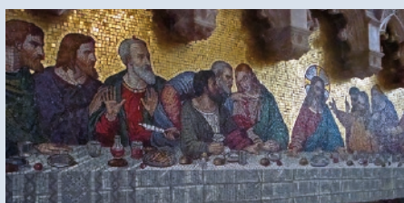
How to join the Friends of Luton Parish Church - P2